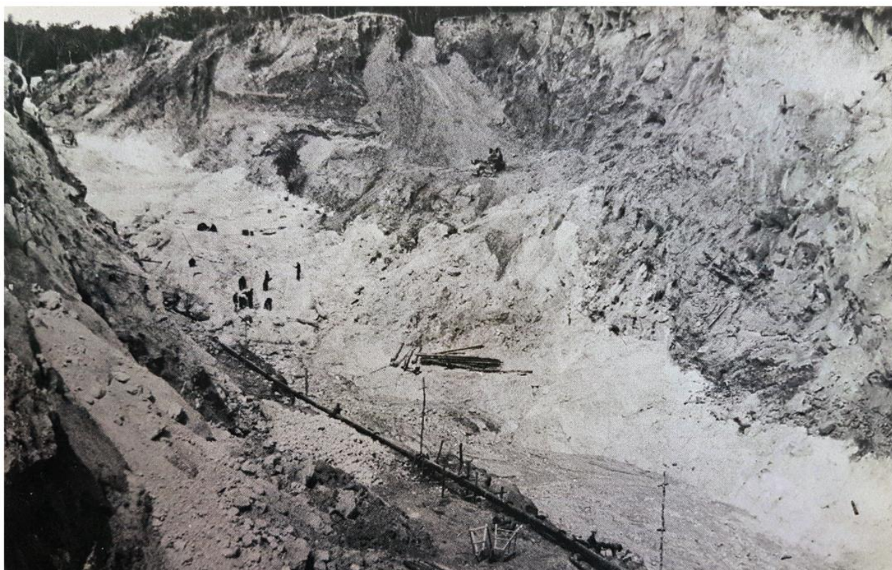
Lepidolite-pegmatite cutting mudstone of the Phuket Group, Reung Kiet Mine, 11 km south-west of Takua Thung. The light-coloured pegmatite in the lowest part of the excavation contrasts vividly with the darker coloured mudstones forming the steep slopes.

Readers are advised to refer to the 18 November 2016 ASX announcement “Viking Acquires Lithium and Tungsten Projects in Thailand” for further information.